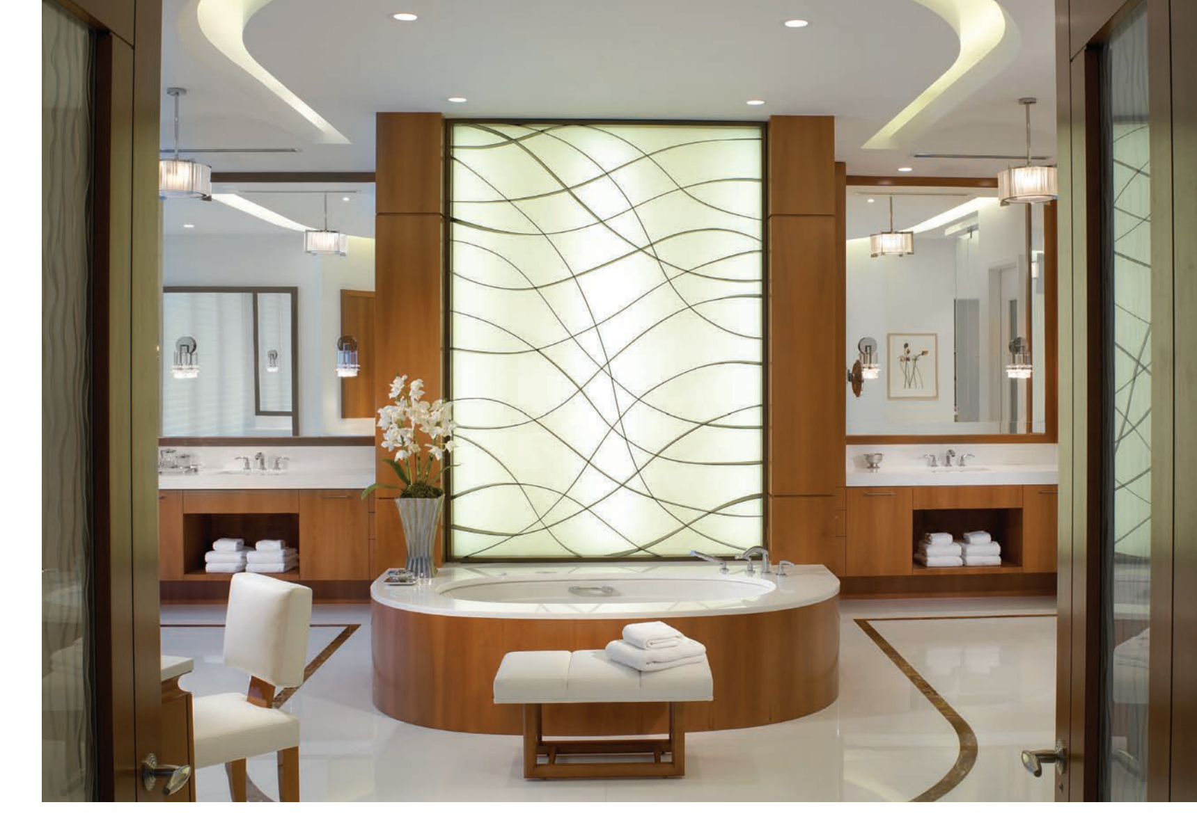
Overflowing with luxury and self-indulgence, the large glass feature wall in the master bathroom gives the space a very different appeal.