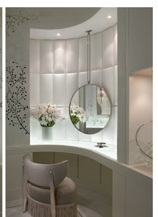
Metropolitan Home | 73